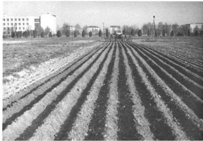
Fig. 2. General view of combs on the soil surface

Spring pre-sowing tillage, involves cutting the tops of combs 30 ... 40 mm high, and is performed by a machine unit consisting of a tractor 1 (Fig. 3a) and a row cultivator 2, followed by sowing seeds with a precision seeder (Fig. 3c) in the area of cut vertices of the comb (Fig. 3b).